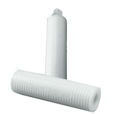
Figure 1: Memtrex NY filters